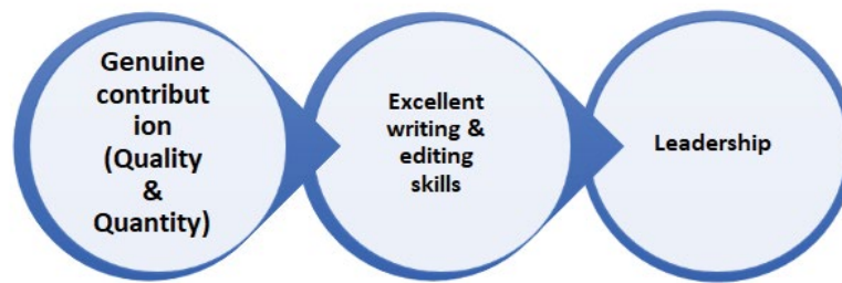
Figure 4 The authorship order criteria

Authorship order is a common issue for most researchers worldwide-especially beginners. Someone may think, who deserves to be an author? .The best way is to refer to the International Committee of Medical Journal Editors as they stated the following: substantial contributions to the conception or design of the work; or the acquisition, analysis, or interpretation of data for the work; and drafting the work or critically reviewing it for important intellectual content; and final approval of the version to be published; and agreement to be responsible for all aspects of the work in ensuring that questions related to the accuracy or integrity of any part of the work are appropriately investigated and resolved [8]. The authorship order criteria are provided in Figure 4, One of the essential features of being the primary author is that you care about your project and provide great effort with high quality. Another feature is that you should have leadership skills or a hyperdynamic personality to keep your project moving forward [9].