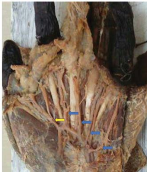
Figure 1 Yellow arrow showing arteria princeps pollicis and radialis indicis arising from the superficial palmar arch; blue arrow shows 1 proper and 3 common palmar branches